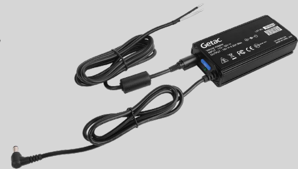
Bare Wire Version