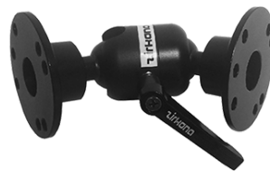
Zirkona Medium Joiner, 2 Round AMPS Plates Item No. 7160-1239