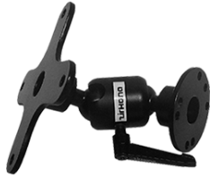
Zirkona Medium Joiner, VESA 75mm Plate Item No. 7160-1179

This solution can be used in conjunction with a Zirkona semi-truck mount below.