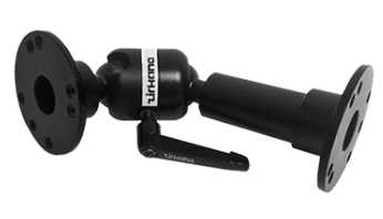
Zirkona Medium Joiner, 2 Round AMPS Plates, 2" Extension Item No. 7160-1240