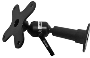
Zirkona Medium Joiner, Vesa 75mm Plate, 2" Extension Item No. 7160-1180