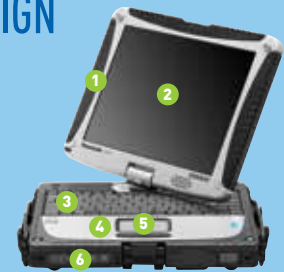
4 Wrist Area