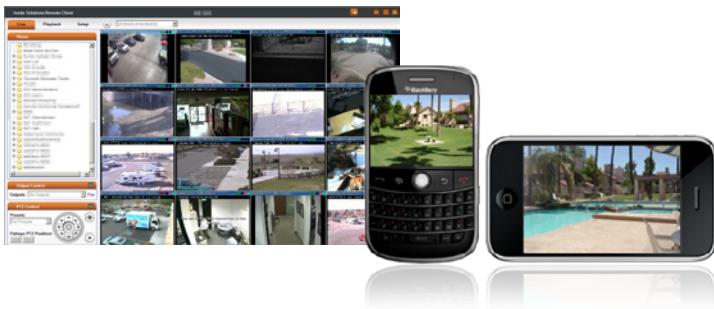
User-friendly, Web-based centralized camera management system

The ESS is a self-contained portable surveillance unit, equipped with an "always on" network for connection capability from an integrated 3G EVDO Rev and a cellular router. The camera is shipped pre-configured and ready for deployment on leading broadband cellular networks, such as Sprint® and Verizon®. All you need is power and cellular data card which can be purchased through the carrier or through Iveda Solutions. The ESS is portable, thus well-suited for applications that require temporary high-quality video surveillance, such as public safety, stake outs, and construction. Of course, this unit can also be used for permanent video surveillance.