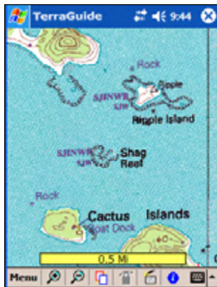
The Recon's touchscreen with LED backlight is bright and clear, even in direct sunlight or low-light conditions.

Lightweight and comfortable to hold, the Recon is built tough to work reliably and keep your data safe in rugged field conditions.